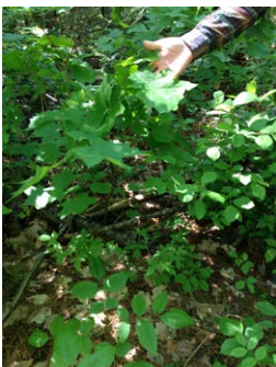
Large leaves in understory